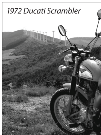
1972 Ducati Scrambler

Because of the widespread public interest and concern about OHV recreation, state legislators Gene Chappie (an OHV enthusiast) and Ed Z’berg (an environmentalist) drafted legislation to balance the demand for OHV recreation with the need to protect resources. In 1971, the state legislature enacted the